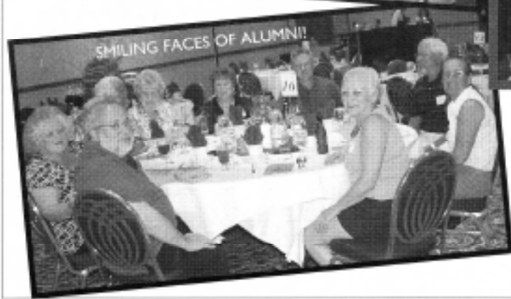
SMILING FACES OF ALUMNI!!