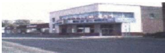
A more current picture of the Englewood Theater

Phone Number in the early 50's was "CL-9362"