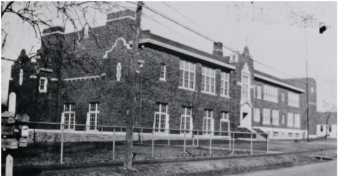
Bristol School facing Northern Blvd at 15 St. After 1924 addition. (Maywood Baptist Church back right)