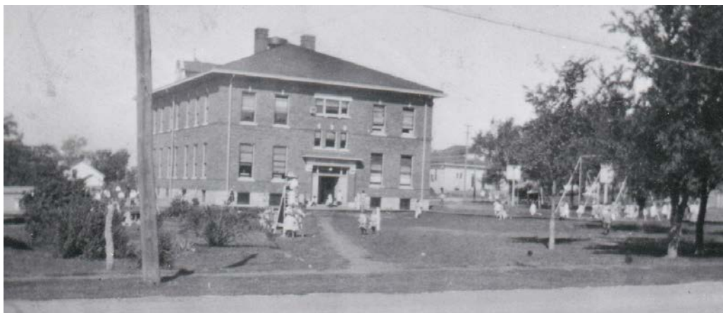
Bristol School facing Northern Blvd. at 15th St. Prior to 1924 addition (Maywood Baptist Meeting Hall back right)