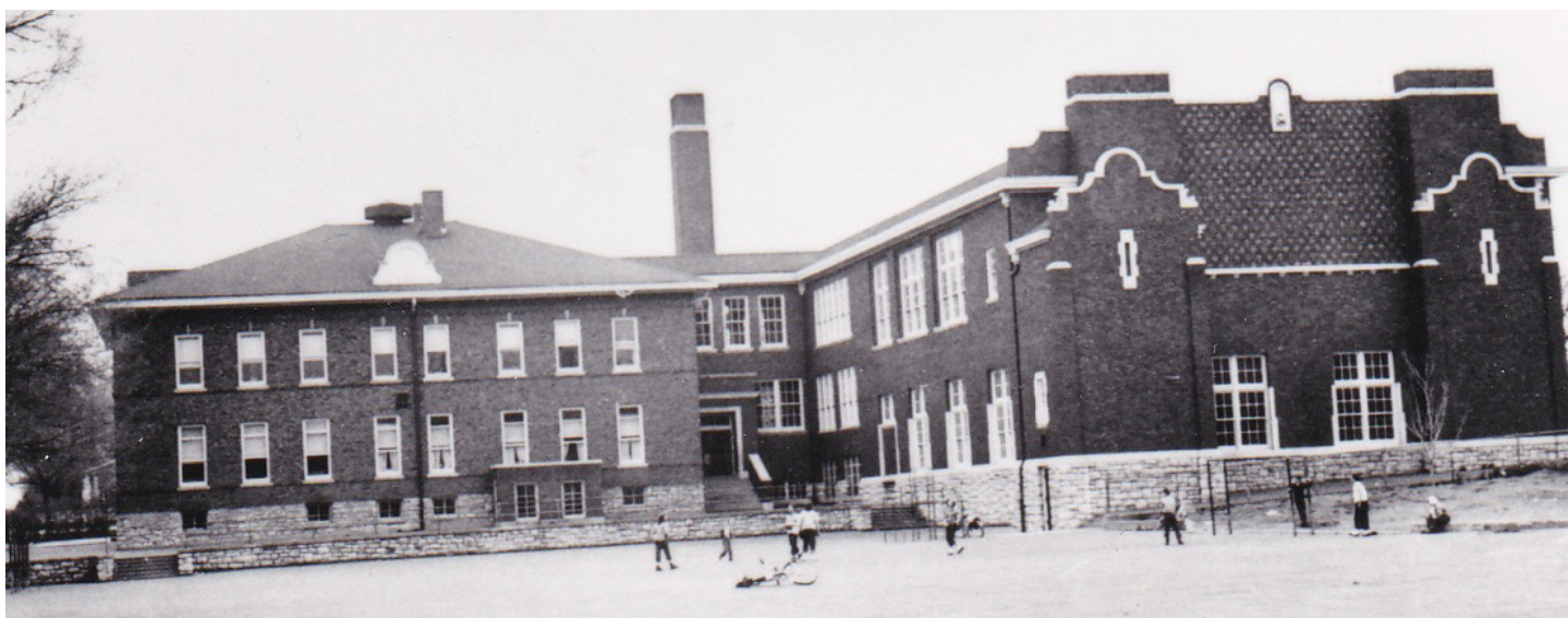
Bristol School From the South Playground. C. 1940's/1950's