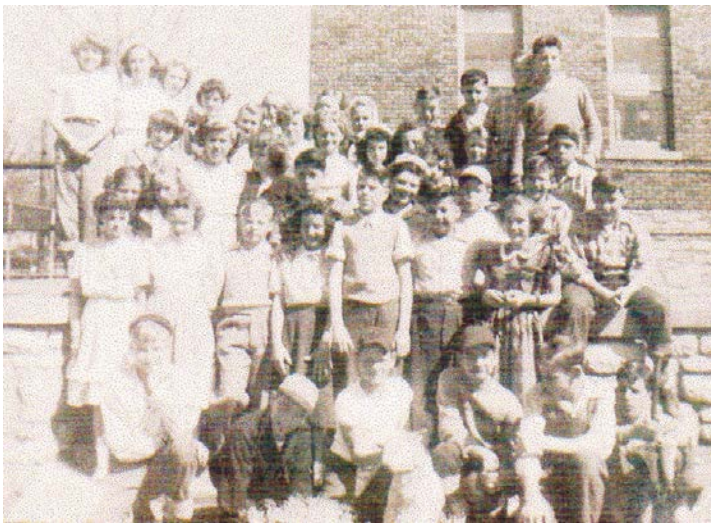
Bristol School Class C. 1948