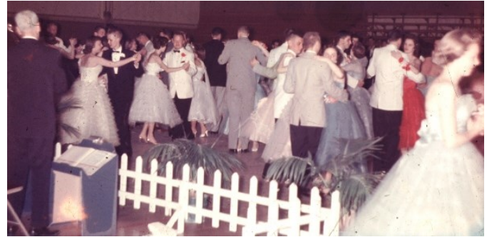
BRISTOL TEEN TOWN – A Series

Teen Town was started in the fall of 1946 by a few parents who wanted to give their teenage children an alternative to traveling (by bus, mostly) over to Independence Avenue and Benton Boulevard about 8 miles away for weekly dances. These dances were held in a hall on the second floor above the Benton movie theater. The parents felt that was too far for late-at-night travel even though the students traveled to that area of town to attend high school.