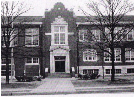
1500 S. Northern Blvd. Independence, MO 64052 Phone #: CL-9362