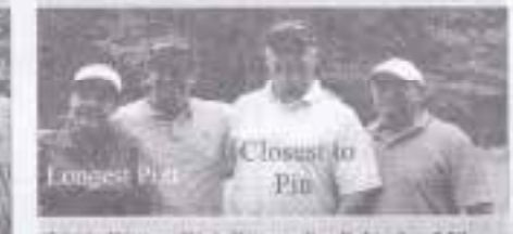
Longest Put Closest to Pin