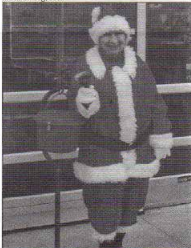
Senior Living, 2012