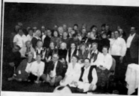
Northeast Alums at Arizona Reunion