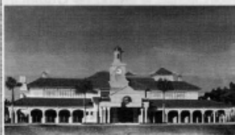
The International Museum of Cartoon Art