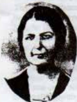
Who's U.S. Grant?