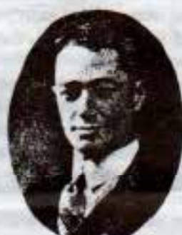
Someday the Moon!