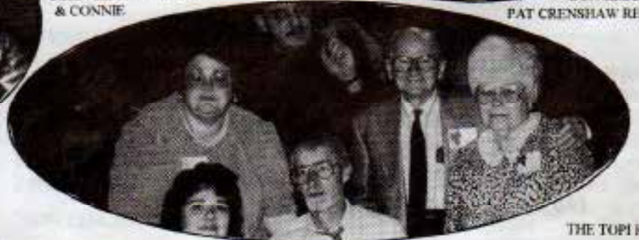
THE TOPI FAMILY