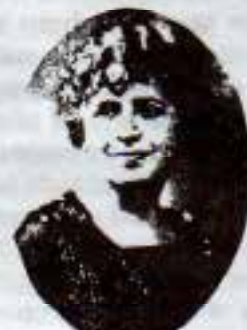
To be or Not to be?