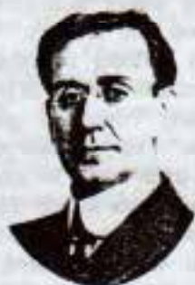
Called him "Pop"