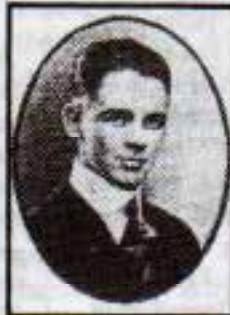
Maxwell Taylor 1917 Senior

Maxwell Davenport Taylor was born August 26, 1901, in Keytesville, MO. He attended Ashland Grade School and Northeast High, graduating in the Class of 1917. He was Secretary of his Senior Class and had been a member of the debating team,