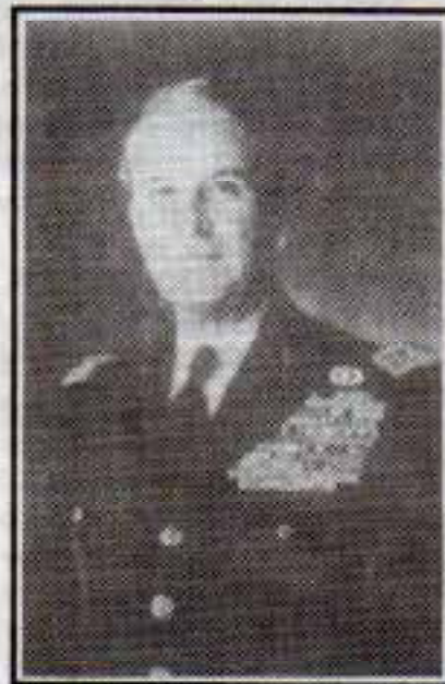
GENERAL MAXWELL TAYLOR

He attended West Point and graduated in 1922, fourth in a class of 102. During World War II he commanded the 101st Airborne Division in the invasion of Europe.